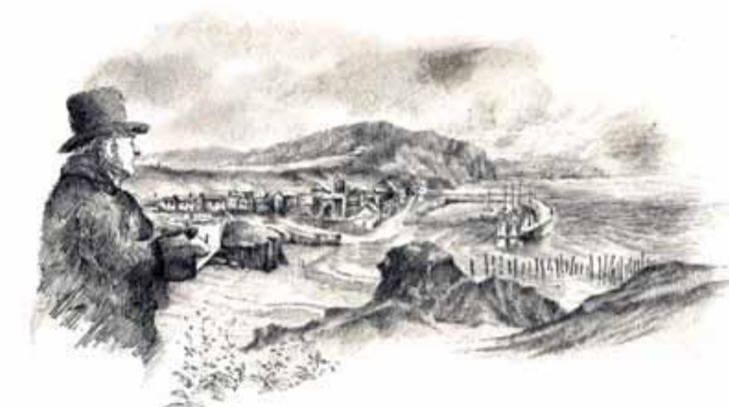
John Mallard William Turner 1775-1851

Turner was an English Romanticist Landscape painter, now considered to be one of the finest painters in British history. Often called 'The painter of light' his work is sometimes thought to be the precursor to Impressionism. One of his most famous paintings is The Fighting Temeraire which hangs in the National Gallery in London.